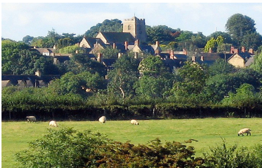
Sheep grazing the pasture land to the east of the village.