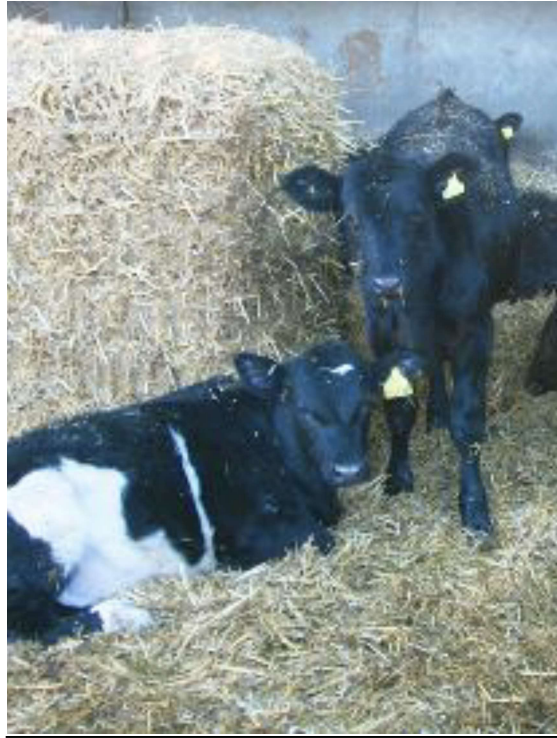
Beef cattle safely housed for the winter

A month where nothing much happens in the countryside and the agricultural world. It is a month when the maintenance of hedges and boundaries are trimmed and repaired. Please take note of the excellent workmanship that can be seen in the erection of the new stock fencing up the Moreton Road and on the Barrow hill footpath in readiness for sheep grazing next spring.