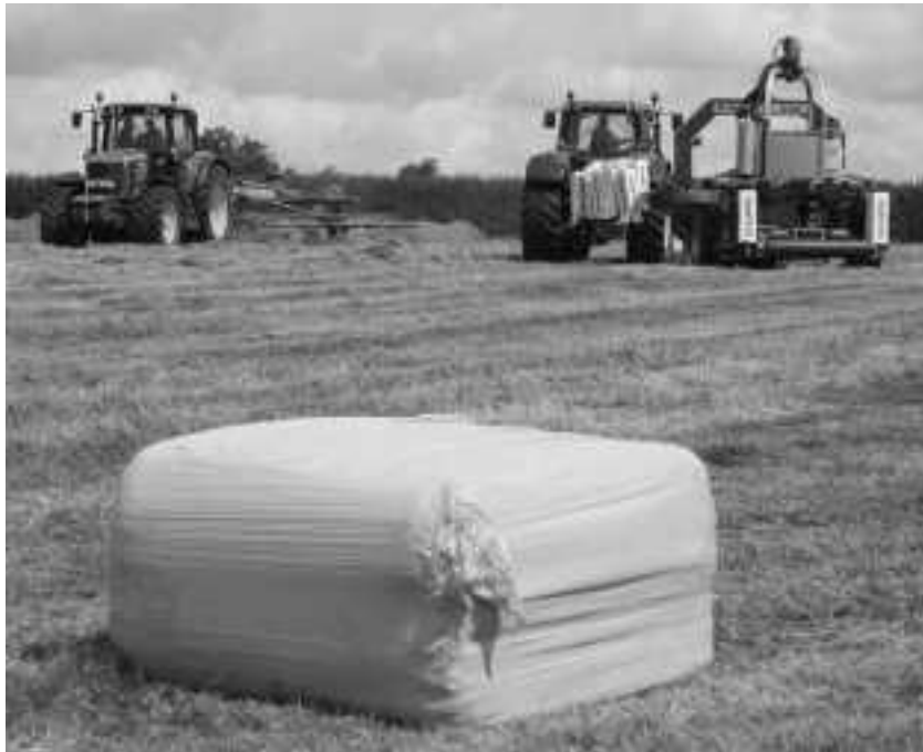
Modern hay making, with the hay being stored in plastic parcels as "haylage".

Late May early June is shearing time for the sheep, but this year it is later simply because the shearing gangs from New Zealand have not come over in their usual numbers, because of Covid restrictions and therefore a shortage of shearers. It needs to be warm to shear. When the lanolin has risen the wool falls off much easier. On the Stuchbury footpath you may have noticed a ewe with no fleece. Her wool has fallen off. This has been caused I suspect by a course of antibiotics at lambing time. Wool has among its many uses great insulating properties. A natural product sadly underused. A sheep farmer friend tried to sell fleeces to undertakers to line coffins, but with only limited success. The problem being he didn't get any customer feedback!