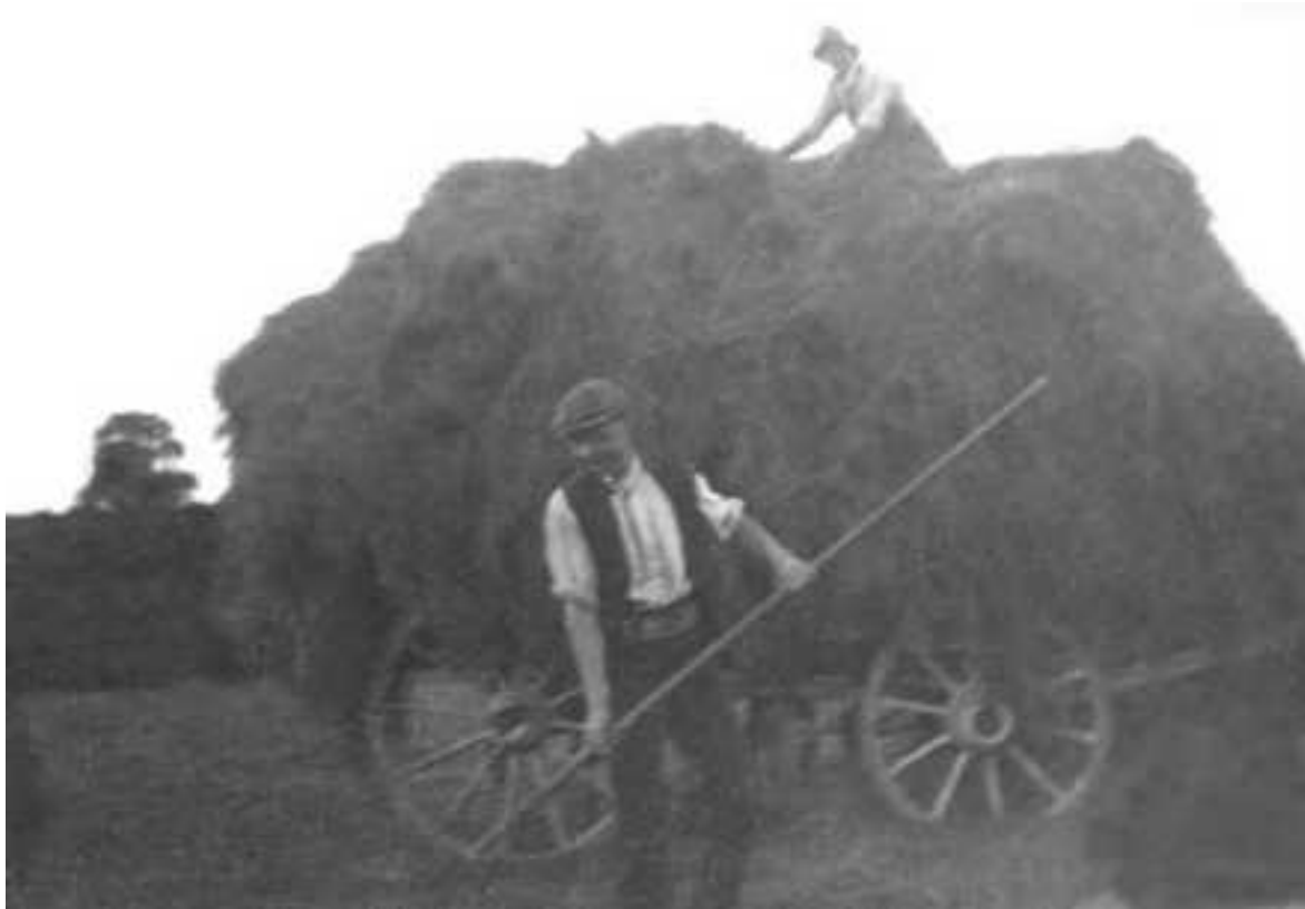
Hay making in Sulgrave in the 1920s (Bill Branson)

June was always hay making month, but nowadays silage is more likely to be made, or haylage where the grass is wrapped in plastic and preserved that way. To make hay is more labour intensive and at the mercy of the weather. Over the next weeks please look out for and take note of the grass mowing, the rapid growth of the maize at Stuchbury, and the flowering of the linseed on the top of Barrow Hill and at the Magpie junction. A wonderful blue flower.