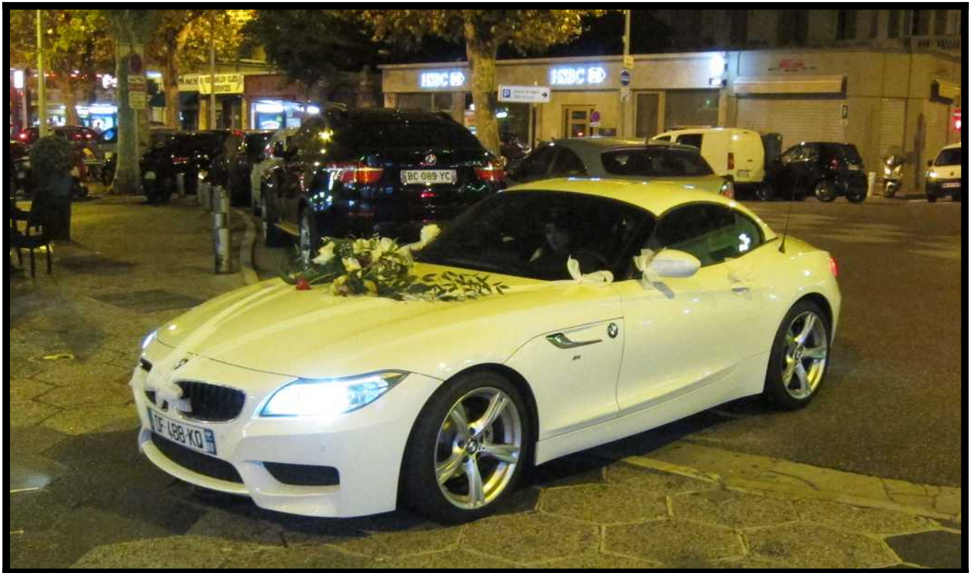
.....the young couple re-appear.....