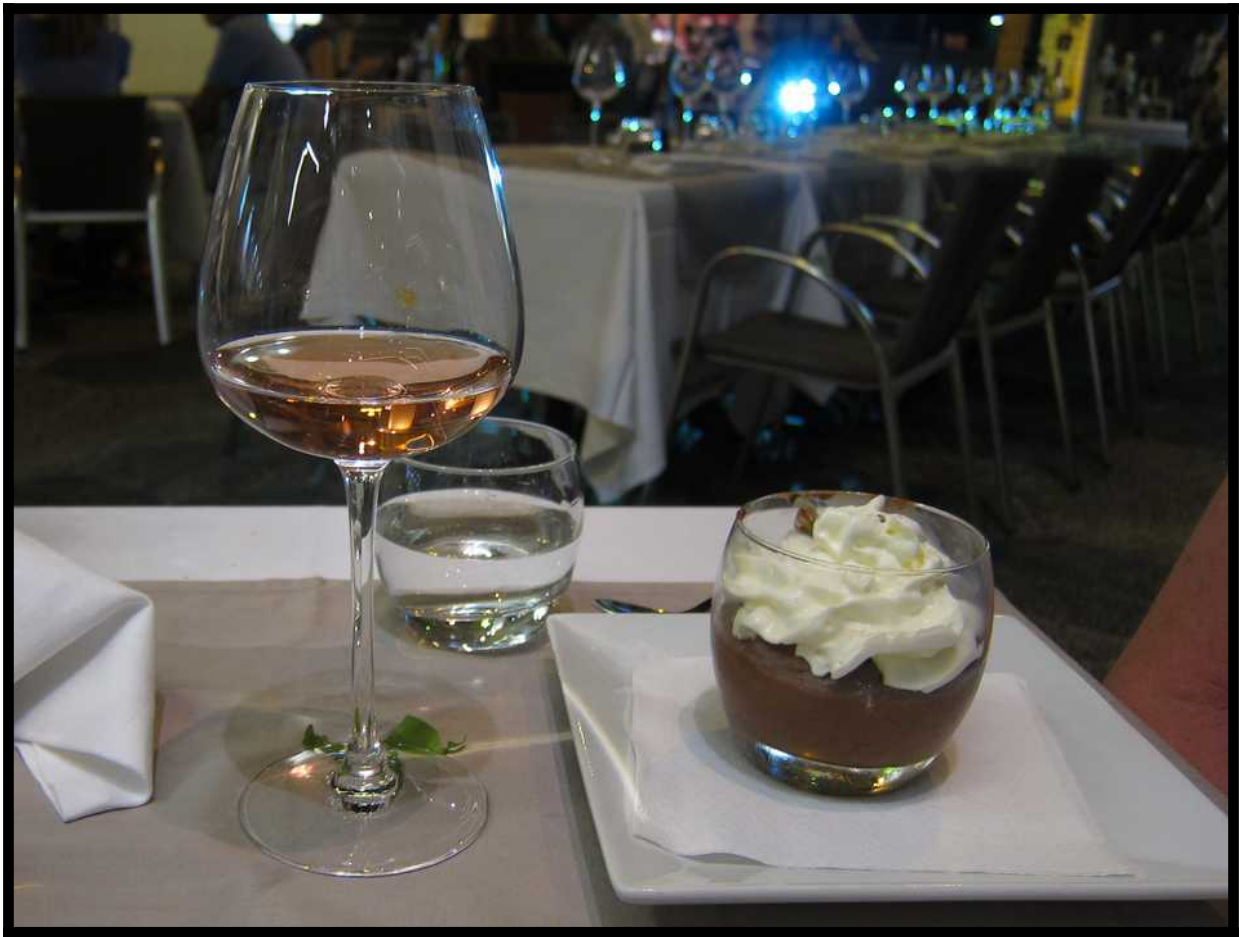
At the end of dinner at a pavement café.....