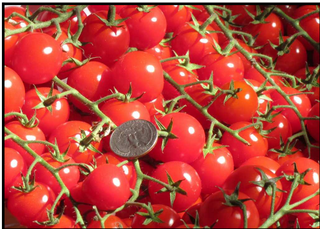
The vegetable market