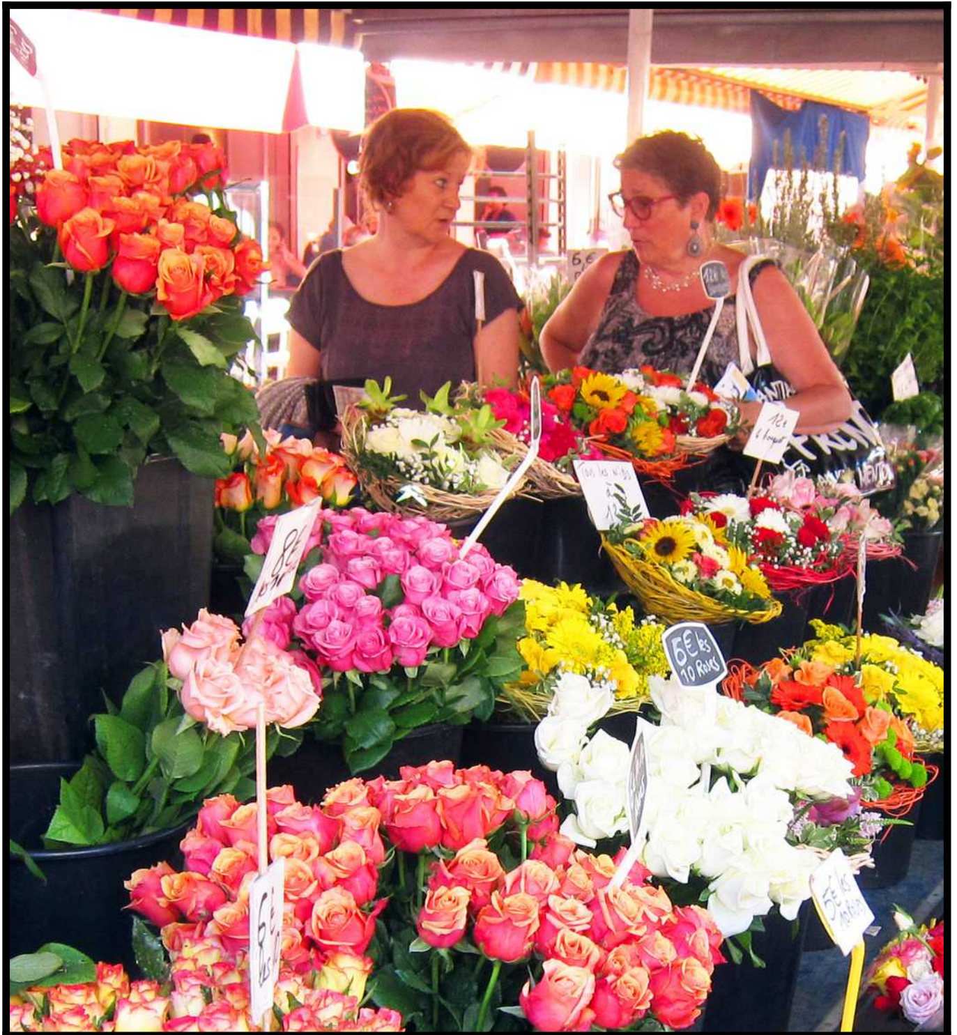
The famous flower market