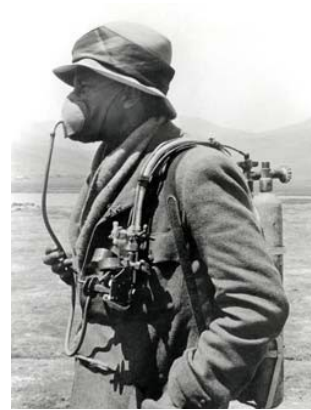
Finch with oxygen set