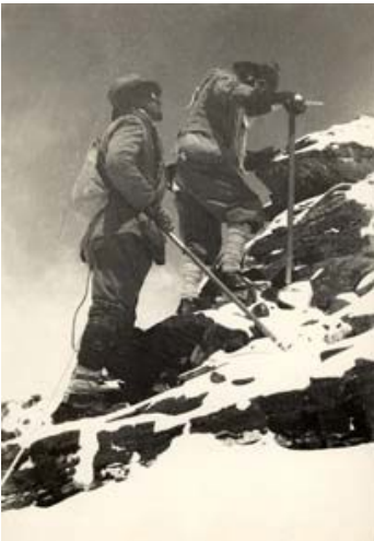
Mallory & Norton North face of Everest by T Howard Somervell

The Alpine Club expeditions carried out reconnaissance, found climbing routes, tested oxygen methods, learnt logistics; all leading to brilliant mountaineering that achieved the first ascent in 1953, now 60 years ago.