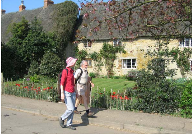
Leaving Sulgrave along Manor Road