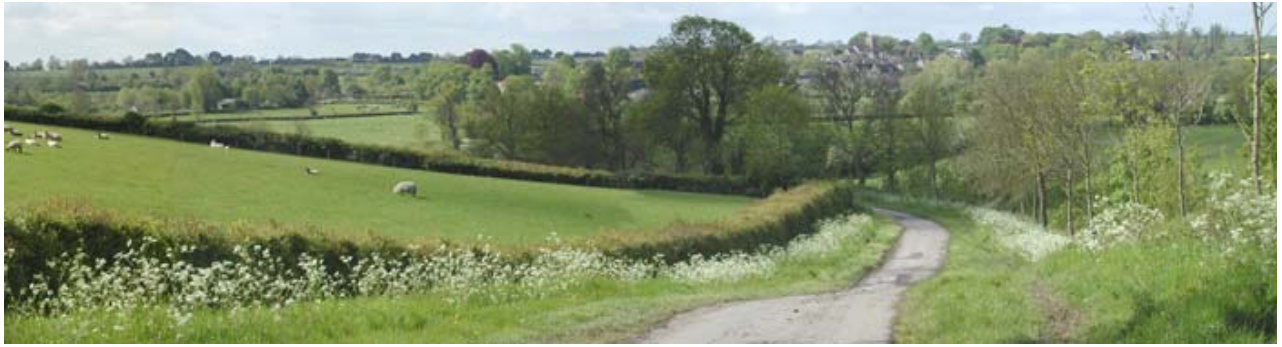
Return to Sulgrave down the Moreton Road