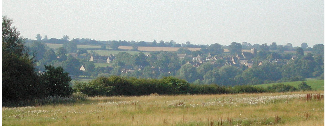
View from the top of the Moreton Road

and a stile and a gap. Through here the footpath bears round to the right immediately,