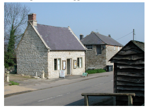
Walk ends at the top of Stockwell Lane by the Village Shop

will come to a metal gate and a stile next to it with a waymarker on your right. Cross the stile here and cut diagonally across the field towards a telegraph pole on the left and then towards a 5 bar gate at the bottom with a stile. Cross the stile and bear right through a small paddock towards a small gate at the end of a brick and stone wall. Here the footpath goes left and ends at a kissing gate. This takes you onto Stockwell Lane. Turn left and at the top you will end your walk at the village shop, opposite the bus stop in the Magpie Road.